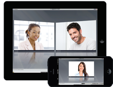
Spontania cloud-based media collaboration