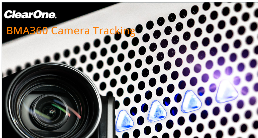
Figure 1. XPanel Home Page